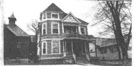
Staff and Intern Housing

In 2009, I entered Teen Challenge and spent 8 months in the program. I still had issues with authority in my life, so I left the program and started pursuing money and drugs again. This caused me to spiral downwards spiritually, and I ended up right back into my addiction.